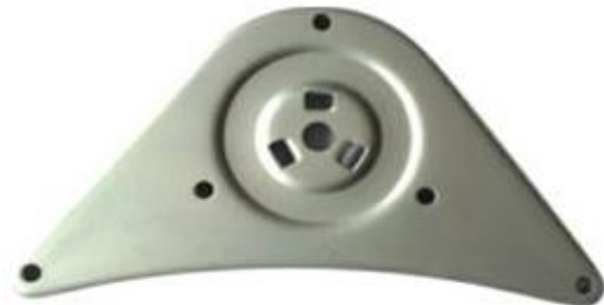
Triangular Steel Base Plate #006