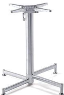
Table Legs, 80mm, Stainless Steel Floor Bases