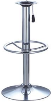
Table Legs with Feet Base Adjustable, 80 mm.