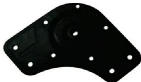
U shape Steel Base Plate #008