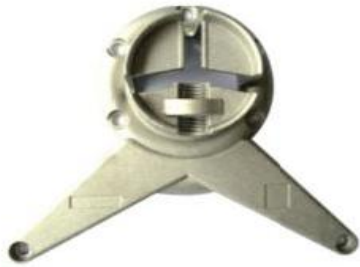
Fish Fork Aluminum Base Plate #001