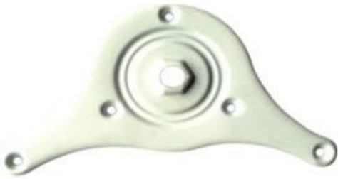
Clow Type Aluminum Base Plate #003