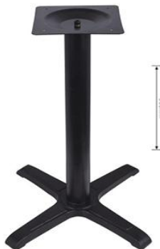
Table Leg with Square base 280x280mm with Floor Base 580mm