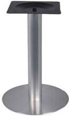
Table Leg with Square base 280 x 280 mm with Floor Base 450mm