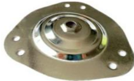
Polygonal Steel Base Plate #004