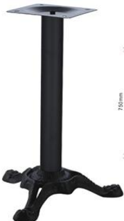
Table Leg with Square base 280 x 280 mm with Floor Base 580mm