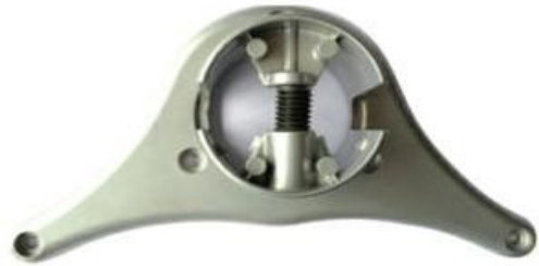
Open Fork Aluminum Base Plate #002