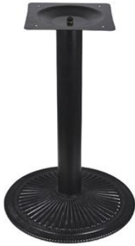
Table Leg with Square base 280x280mm with Floor Base 440mm