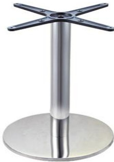
Table Leg with Cross base 290 x 290 mm with Floor Base 450mm