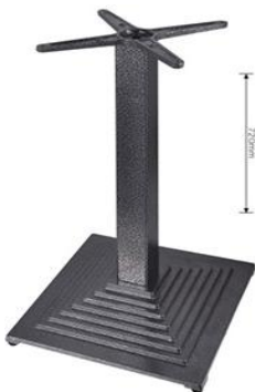
Table Leg with Square base 290 x 290mm with Floor Base 440mm