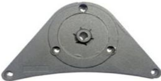
Triangular Aluminum Base Plate #005