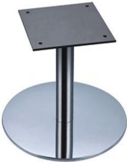
Table Leg with Square base 280x280mm with Floor Base 650mm