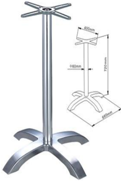
Table Leg with Cross base 290 x 290 mm with Aluminum Floor Base 660mm